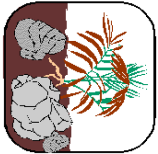
The Rocky Soil