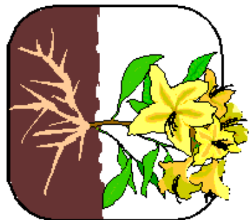
The Good Soil